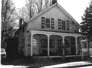
View Parcel Documents

Property: 62 FIRST ST, Glens Falls, 12801 SWIS: 520500 SBL: 309.11-7-13